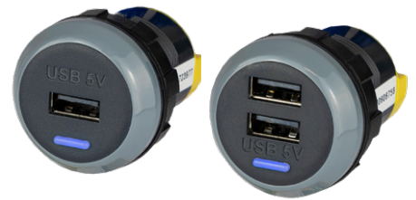
PowerVerter PV65R-S and PV65R-D single and double outlets.